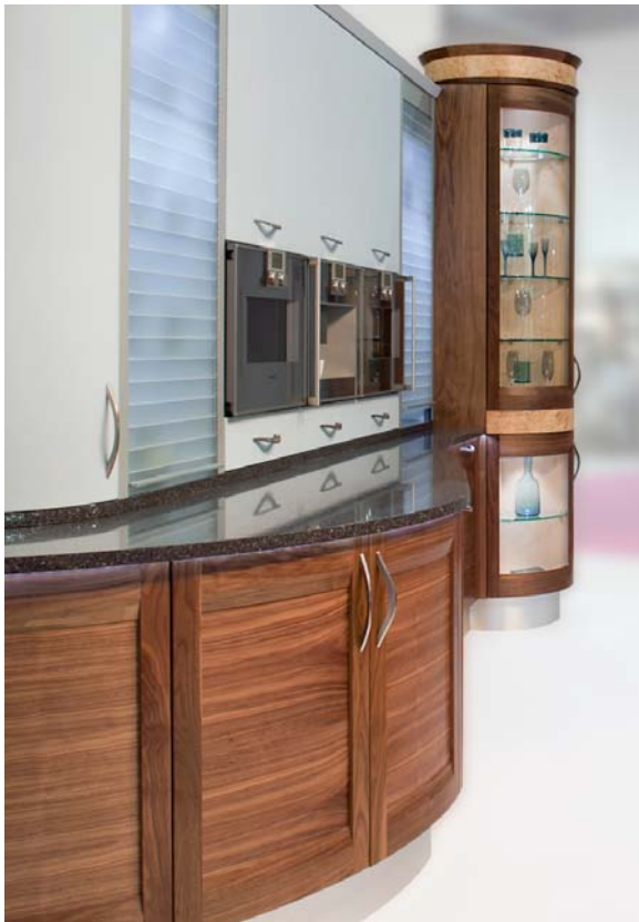
Strata – Natural Walnut – Convex door units with Fusion Blue Ashes. Bespoke Tall Drum unit with convex curved glazed doors to upper/lower areas. 100mm mid and top banding in Masur Birch and Walnut “collars”.