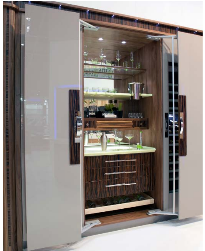
Evolve – High Gloss Solid Acrylic doors (Parapan) – Stone Grey. Natural Walnut frames. Natural Walnut/Ebony Macassar veneers to columns and cornice details. 2 x 450mm width Gaggenau Wine Coolers with integrated doors. Bespoke “Drinks” Tall Unit with gullwing hinged door action.