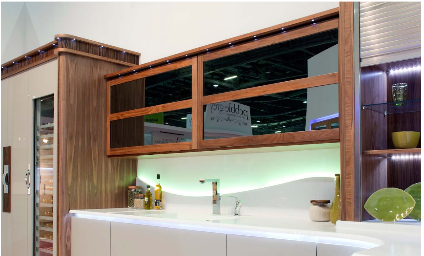
Wall Unit 2400mm length with 2 x parallel sliding doors and soft close action. Mirror glass centre panels/natural walnut frame. Stainless Steel effect tambour with veneered walnut carcass.