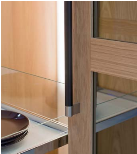
10mm glass shelving used strategically within the design to permit light transference by LED.