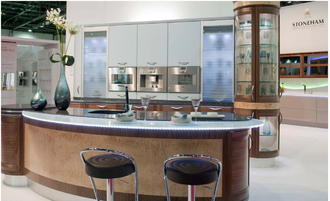
Marlborough Black Walnut (Natural) with Masur Birch veneered back panel (curved) with Natural Walnut collars. Worktops: Silestone Zirconian – 30mm +15mm painted glass +12mm Zirconian surface. LED lighting through glass. Integrated Silestone Zirconian sink to match worksurfaces.