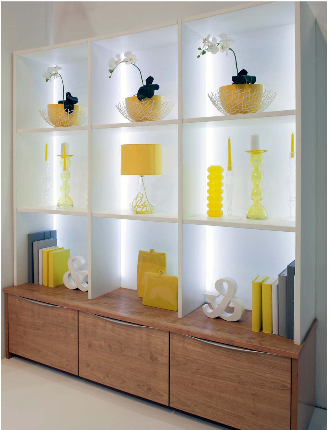
Ambience – American Cherry – horizontal (matched veneers). Trim: TT (Curved) – available Autumn 2011. Shaped American Cherry veneer. Filing cabinet racking. CD Storage drawer. Upper shelving unit: Classic White painted. Concave design.