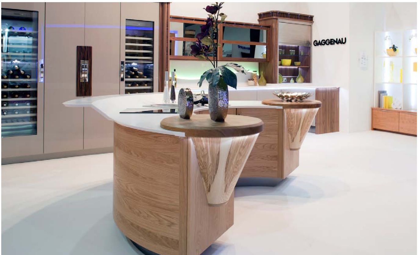
Worktops: Corian - Antartica - Scallop shell wave to raised external bar surface. Solid Light Oak worksurface cappings (circular) to each end of the horseshoe. 600 and 1200mm units with inner and outer (fixed door design).