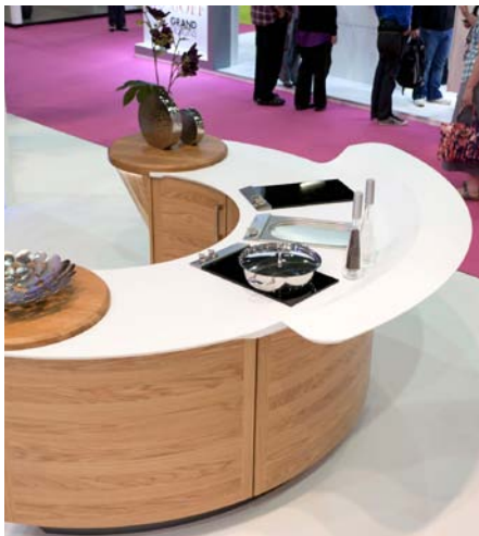
Corian – Antartica – Scallop shell wave to raised external bar surface.