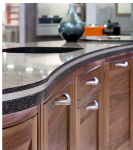
Silestone Zirconian – 30mm + 15mm painted glass + 12mm Zirconian surface. LED lighting through glass.