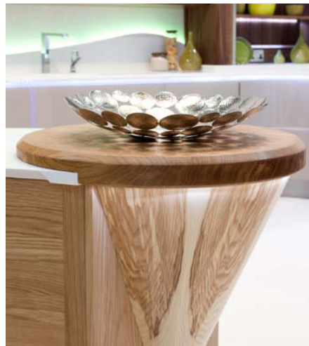
Conical work top supports finished here in Olive Ash veneer