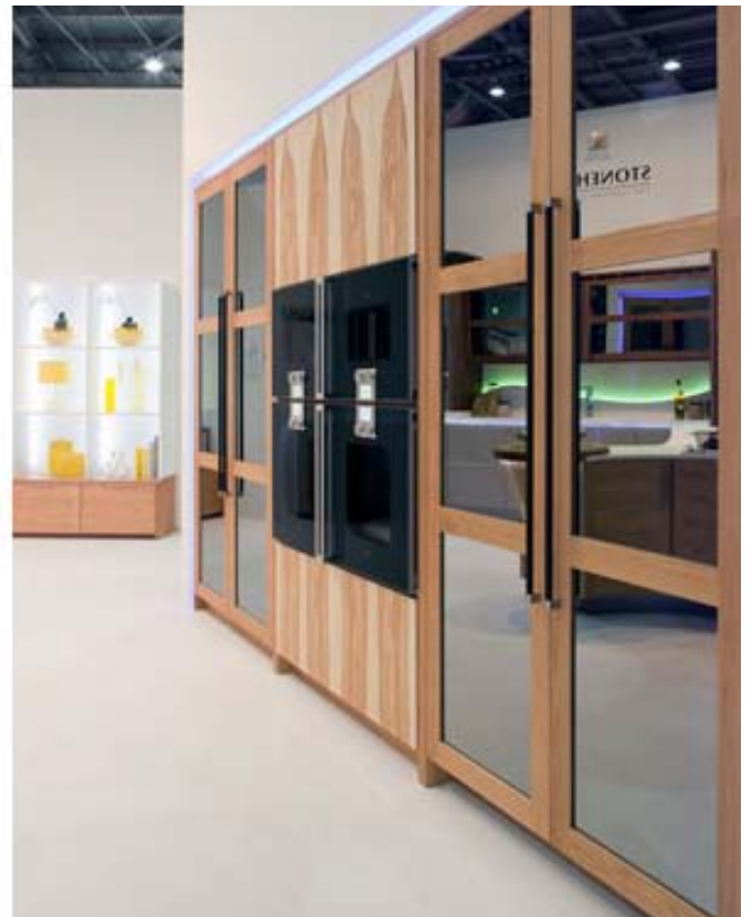
Elan Light Oak (75mm frame) with 3 x cross bar. Black mirror door inserts. 2 x Tall Units – Oak/Black Mirror glass fascias with integrated fridge and freezer units.