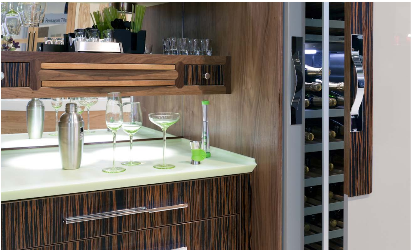
Lime Ice Corian interior shelving, dovetailed maple drawers with Ebony Macassar fronts. Silver mirror back panels. Integral LED lighting.