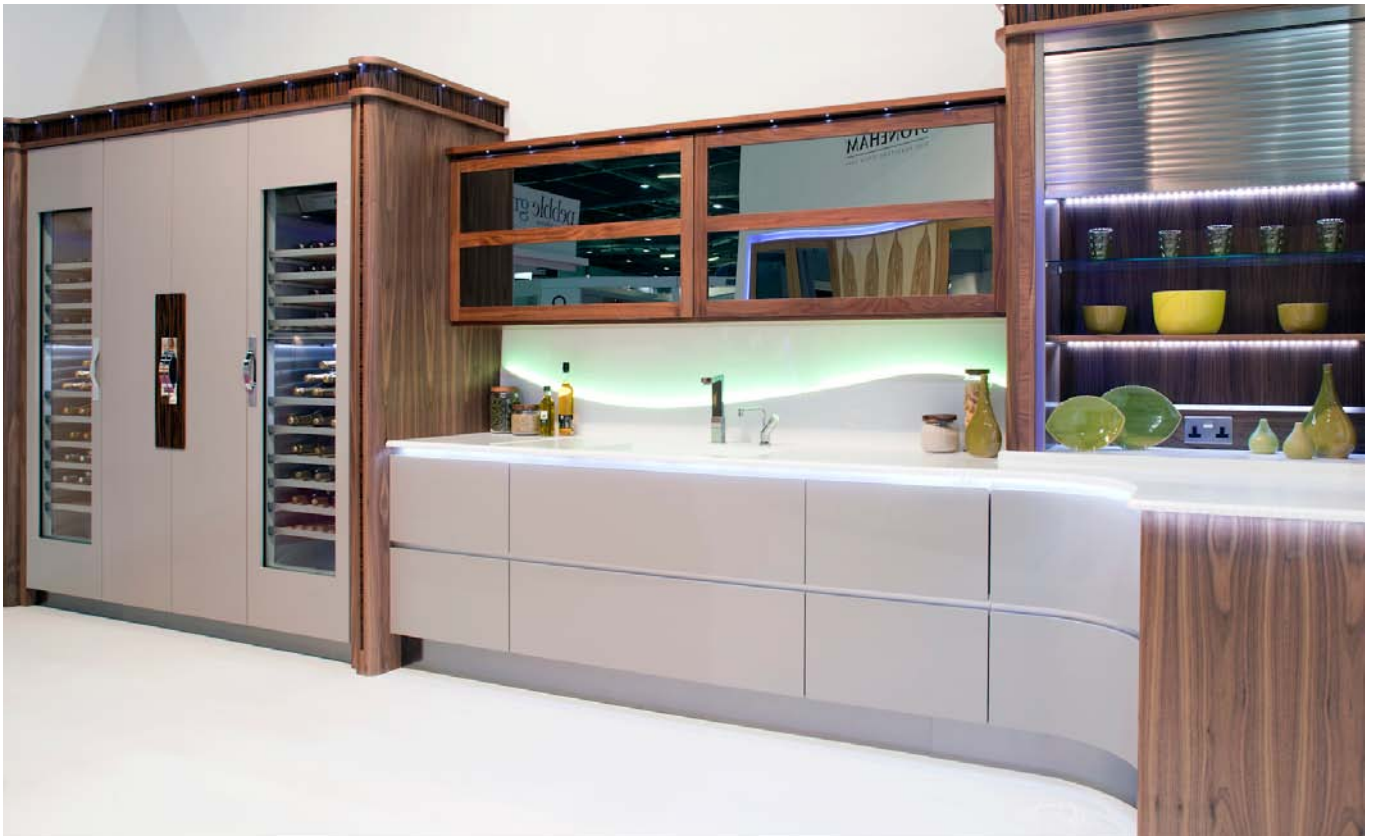
Evolve – High Gloss Solid Acrylic doors (Parapan) – Stone Grey. Natural Walnut frames. Natural Walnut/Ebony Macassar veneers to columns and cornice details. Worktops: Corian Antartica 24mm – with wave detail upstand and RGB lighting feature. Integral sink.