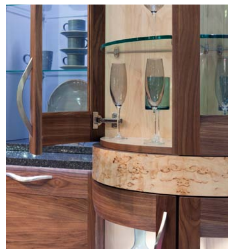
100mm mid and top banding in Masur Birch and Walnut "collars".