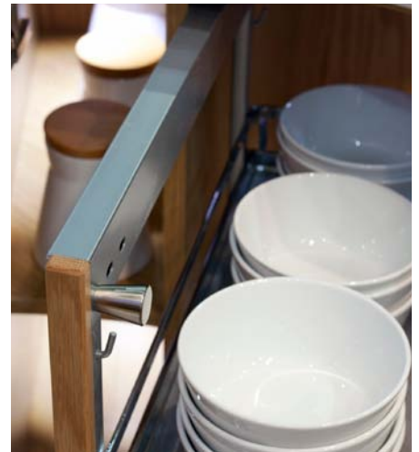
Storage organisation with superb access control.