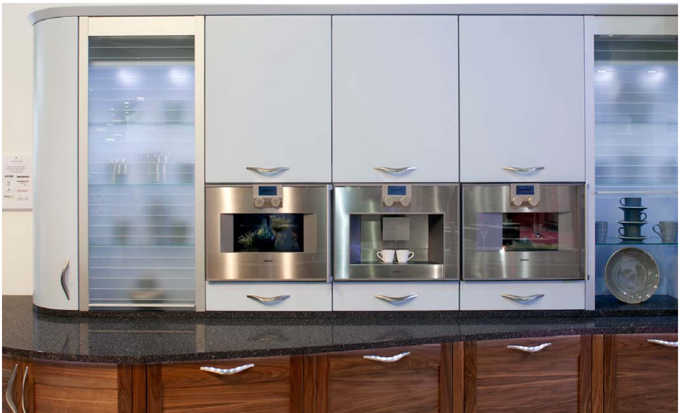
Fusion Blue Ashes. Handles: Convex D (433). Eye Level counter/bar top units comprising coffee/combi microwave/steamer.