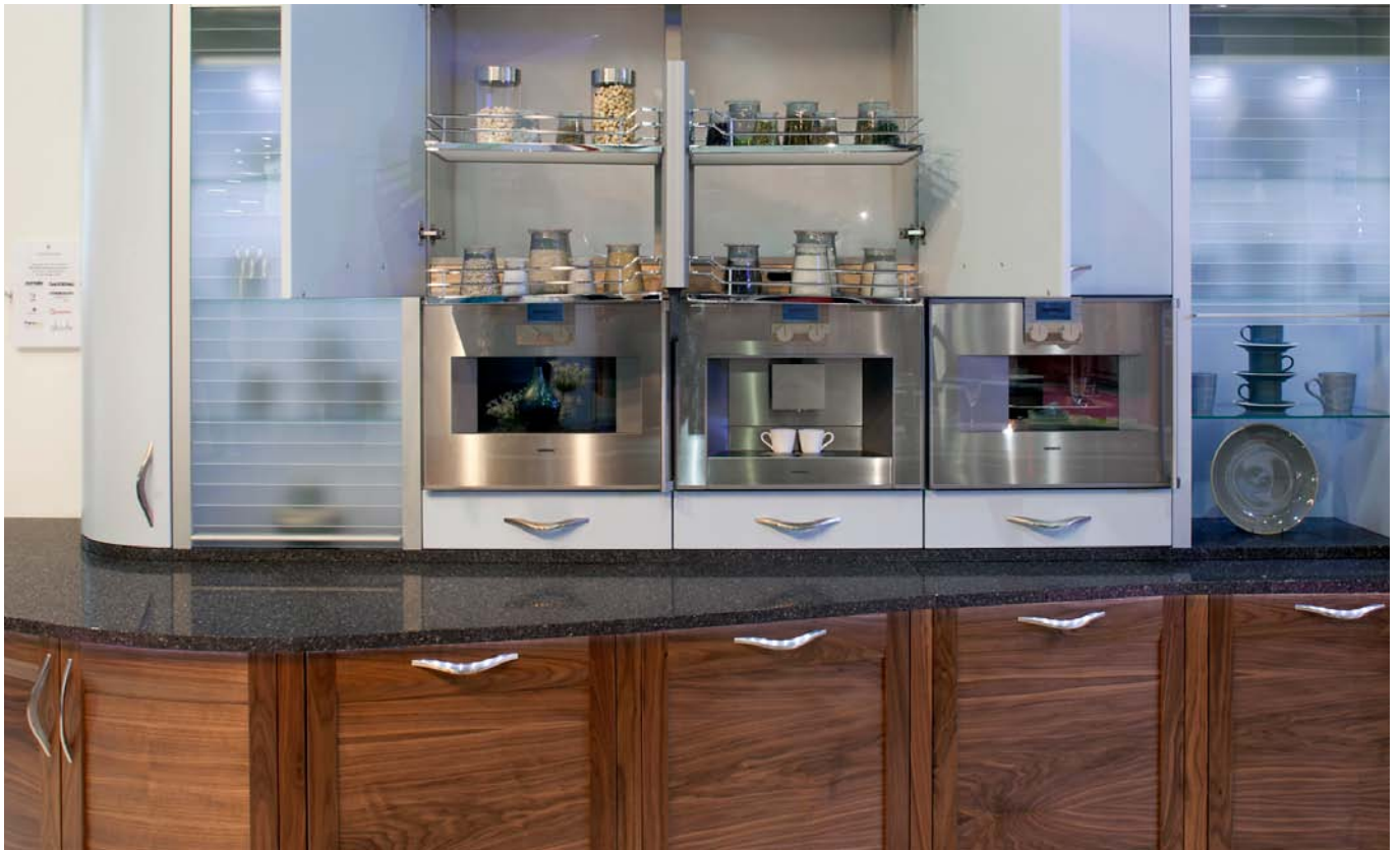
Fusion Blue Ashes. Handles: Convex D (433). Eye Level counter/bar top units comprising coffee/combi microwave/steamer. Pegasus pull down interior wall unit – enhanced access in high level.