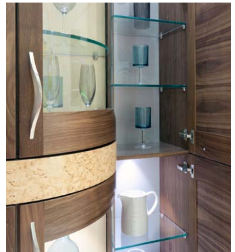
Bespoke Tall Drum unit with convex curved glazed doors to upper/lower areas.