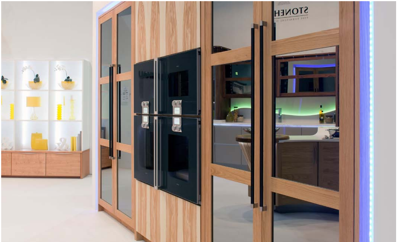
Tall Unit 1200mm width – Olive Ash veneer. Gaggenau Ovens, Steamer and Combi Microwave. LED lighting with RGB to surround perimeter of the tall unit run.