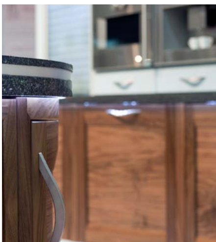
LED lighting used to great effect below worktop edges.