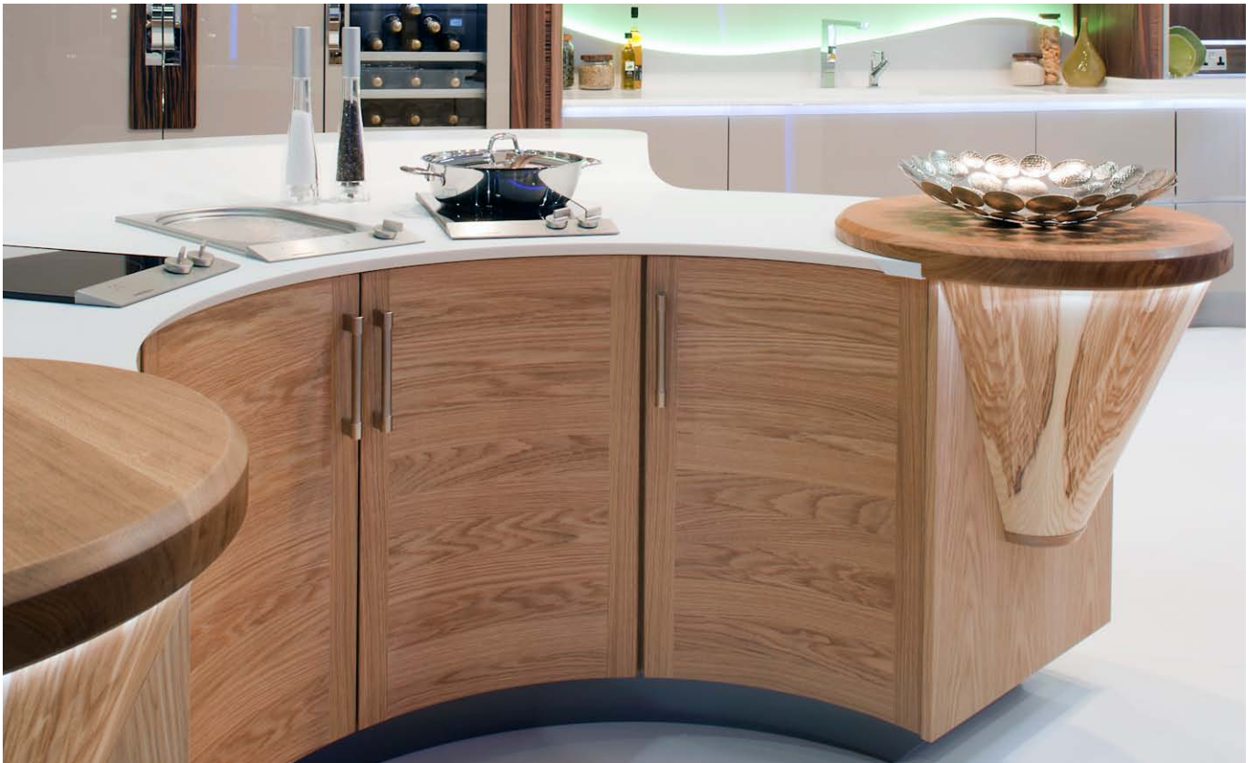
Elan - Light Oak. Horseshoe design with half round cabinetry to each end. Conical support at each end of horseshoe in bespoke veneered Olive Ash.